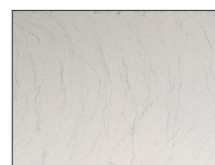
COVERAGE TOO LIGHT